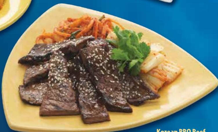
Korean BBQ Beef