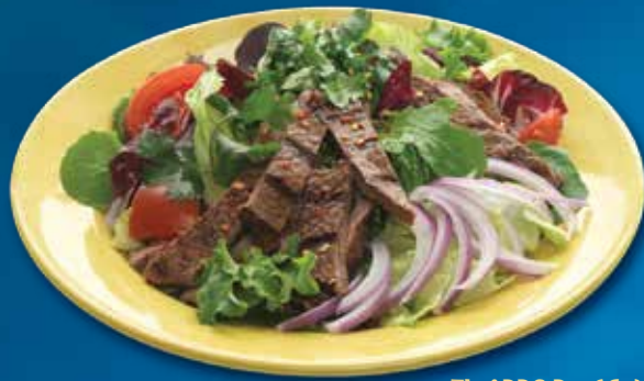
Thai BBQ Beef Salad

Shrimp and sliced chicken placed on a bed of lettuce and mixed greens, and covered with sweet and sour dressing. Garnished with peanuts, onions, chopped scallions and hard-boiled egg.