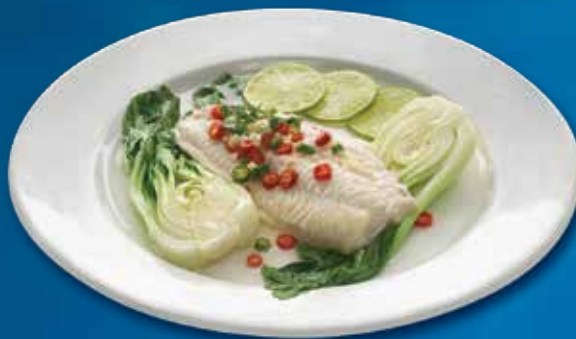
Phu Ket Filet

A fisherman's combination of sautéed sole, squid, scallops, shrimp and mussels seasoned with chili, garlic, onions, red bell pepper and fresh basil leaves.