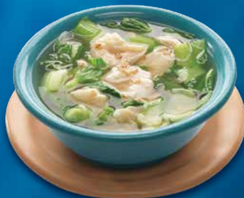
Won Ton Soup

A generous sampling of chicken or beef Sate, Siam Spring Roll, Thailand Shrimp Cake and Westside WonTons. Served with cucumber salad and Thai dipping sauces.