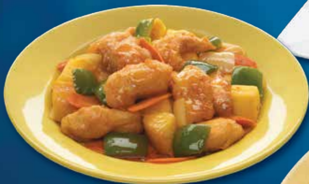
Sweet and Sour

Broiled chicken on a bed of cabbage and broccoli, topped with a peanut sauce.