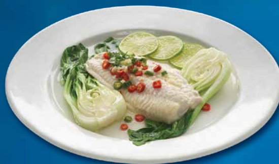
Phu Ket Filet

Sliced squid wok fried with chili, garlic, red bell pepper, fresh basil and onions.