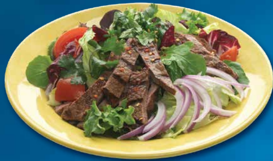
Thai BBQ Beef Salad

Grilled shrimp with lemongrass, green and white onions, cilantro and chili paste tossed in our Thai lime-garlic dressing.