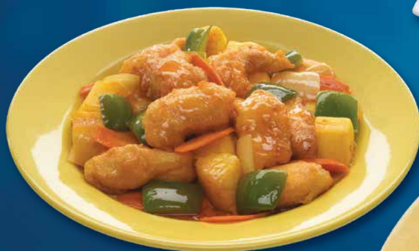
Sweet and Sour